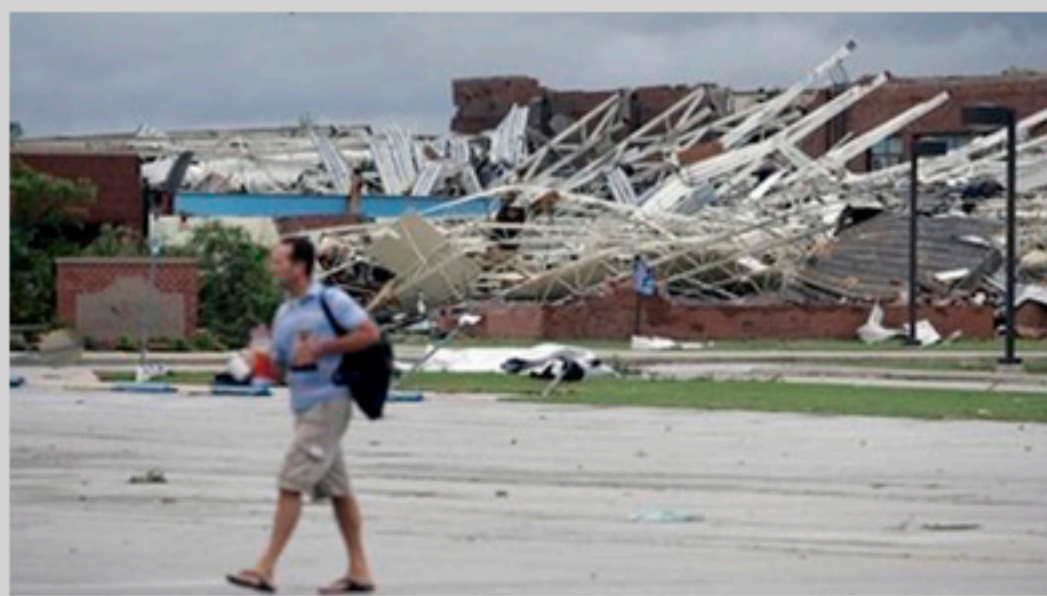
Lake High School in Wood County, Ohio (2010)

Don't wait any longer to prepare your school for an emergency situation such as this one.